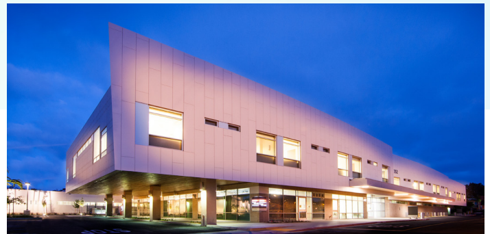
The emergency department serves the booming north county communities with more than 37,000 visits in 2021.

In addition to the plans for a hospital tower, a new medical office pavilion opened in 2021, which provides added convenience for patients. It includes new multidisciplinary clinic space for Scripps MD Anderson Cancer Center, as well as primary and specialty care physician offices.