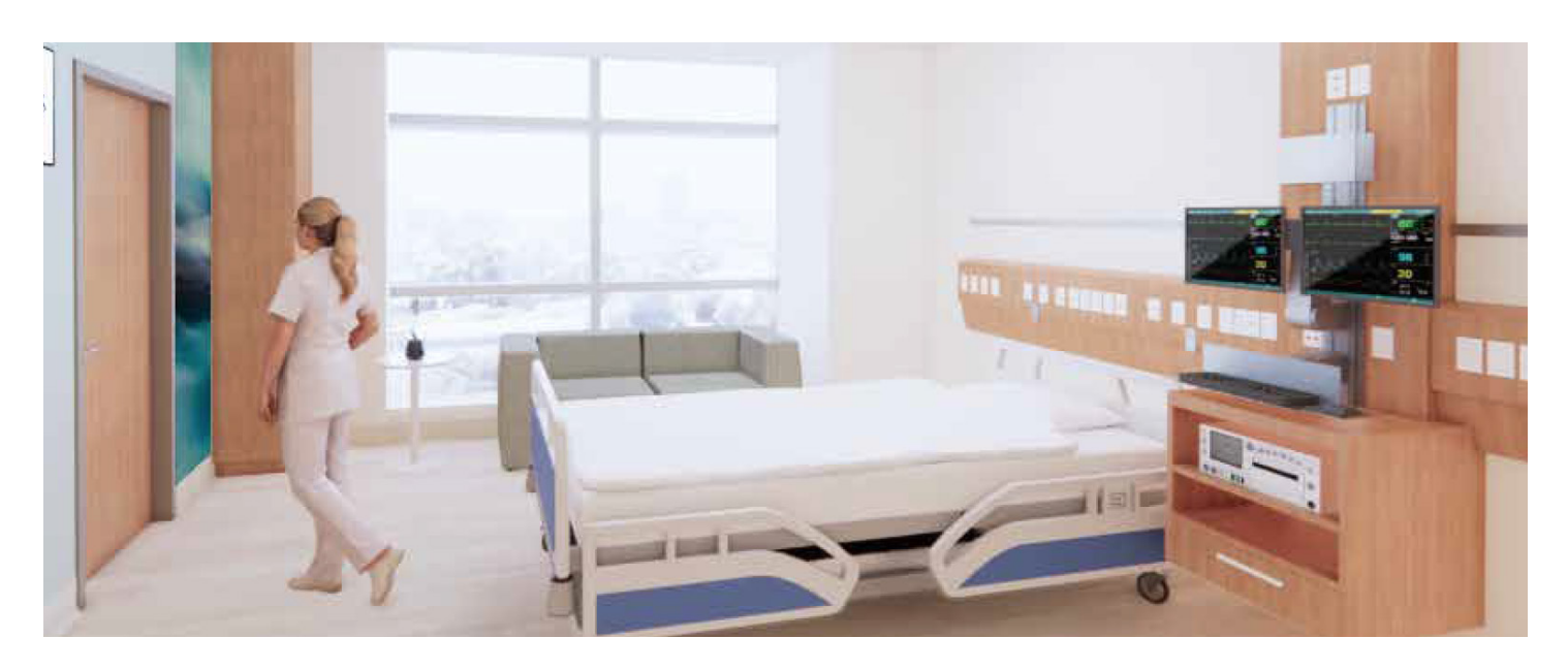
Spacious, private patient rooms include innovative wireless technology and equipment, in addition to amenities to make the stay as comfortable as possible for patients and family members.