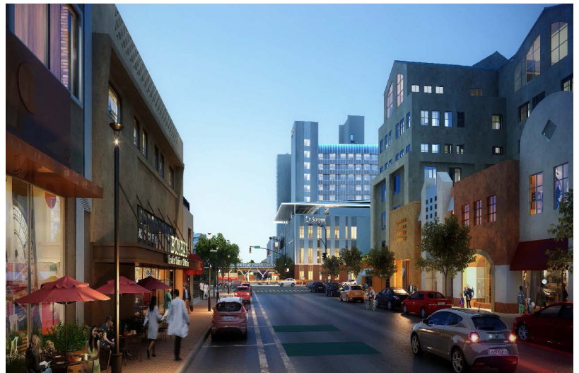
A new hospital tower will serve the growing number of people who need health care living and working in central San Diego.