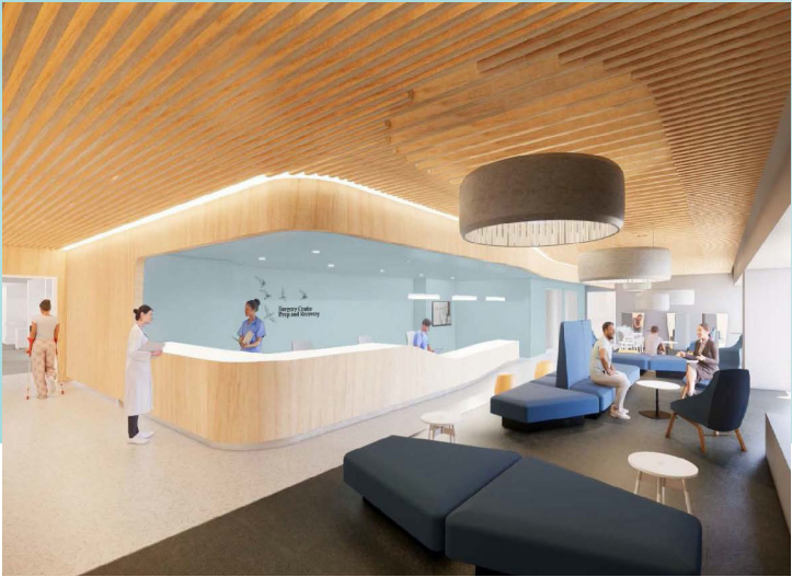
Designated family areas offer comfortable and convenient waiting areas for friends and loved ones.