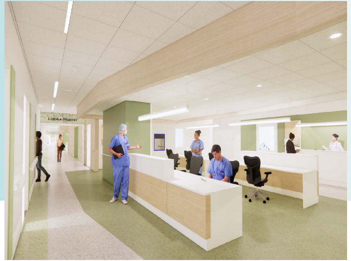
Nurses stations are in close proximity to patient rooms.