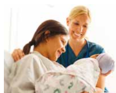
Your gift can help us welcome the next generation of Mercy Babies

While our programs and services exceed the highest standards of care, our labor and delivery facilities need modernization. We are looking to raise $3 million in community support for adequate labor and delivery observation and recovery space, which will improve efficiency, and create a more comfortable setting for mothers and newborns.