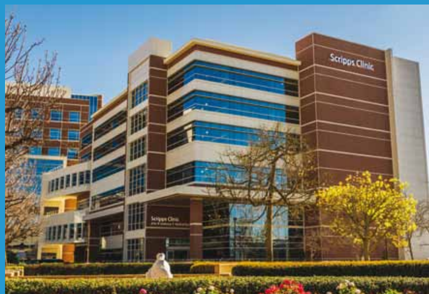
The John R. Anderson V Medical Pavilion opens in June 2016.