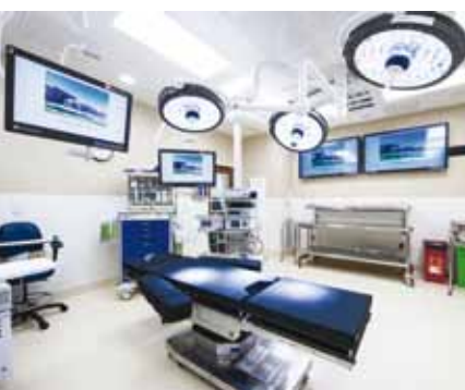
A look at one of the two new operating rooms.

Thanks to our donors, Scripps Memorial Hospital Encinitas achieved a milestone in February with the opening of two, new operating rooms and the expansion of the pre-operative unit. More than halfway to its $10 million goal, the campaign seeks to raise $4.5 million to upgrade four existing operating suites, expand the post-anesthesia unit and double the size of the endoscopy department.