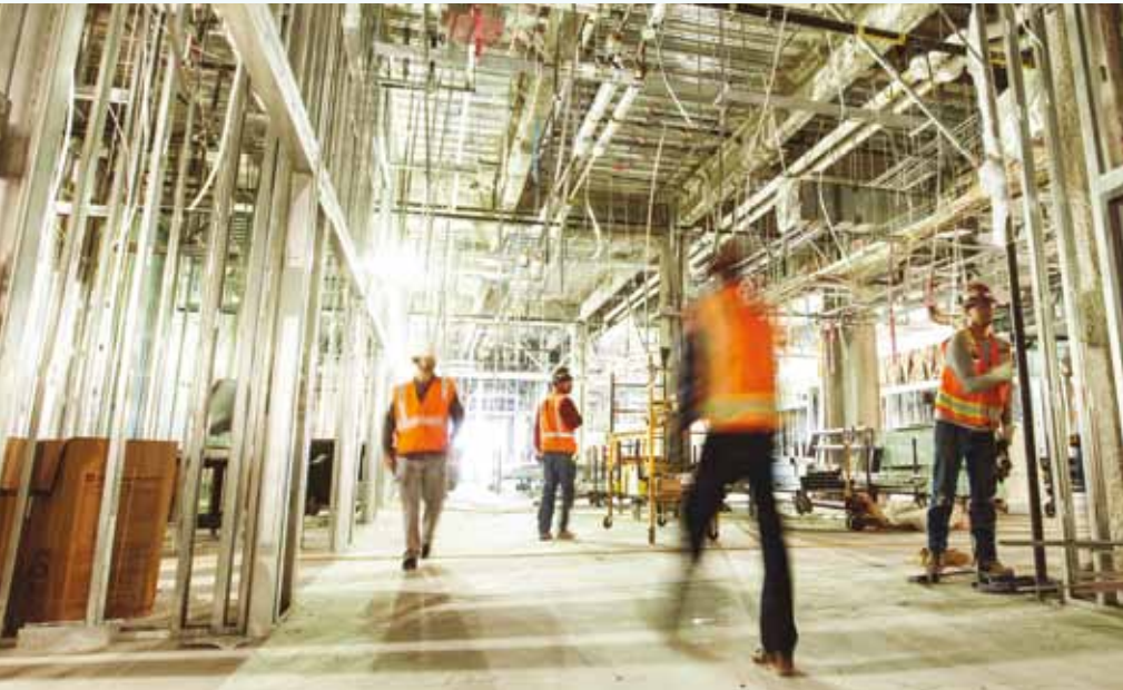
Construction continues on the Barbey Family Emergency and Trauma Center. Opening in fall 2016, the center will more than double the size of the current emergency and trauma facilities.